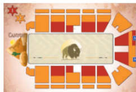
Plan of the arena

*** Menus are subject to modification***